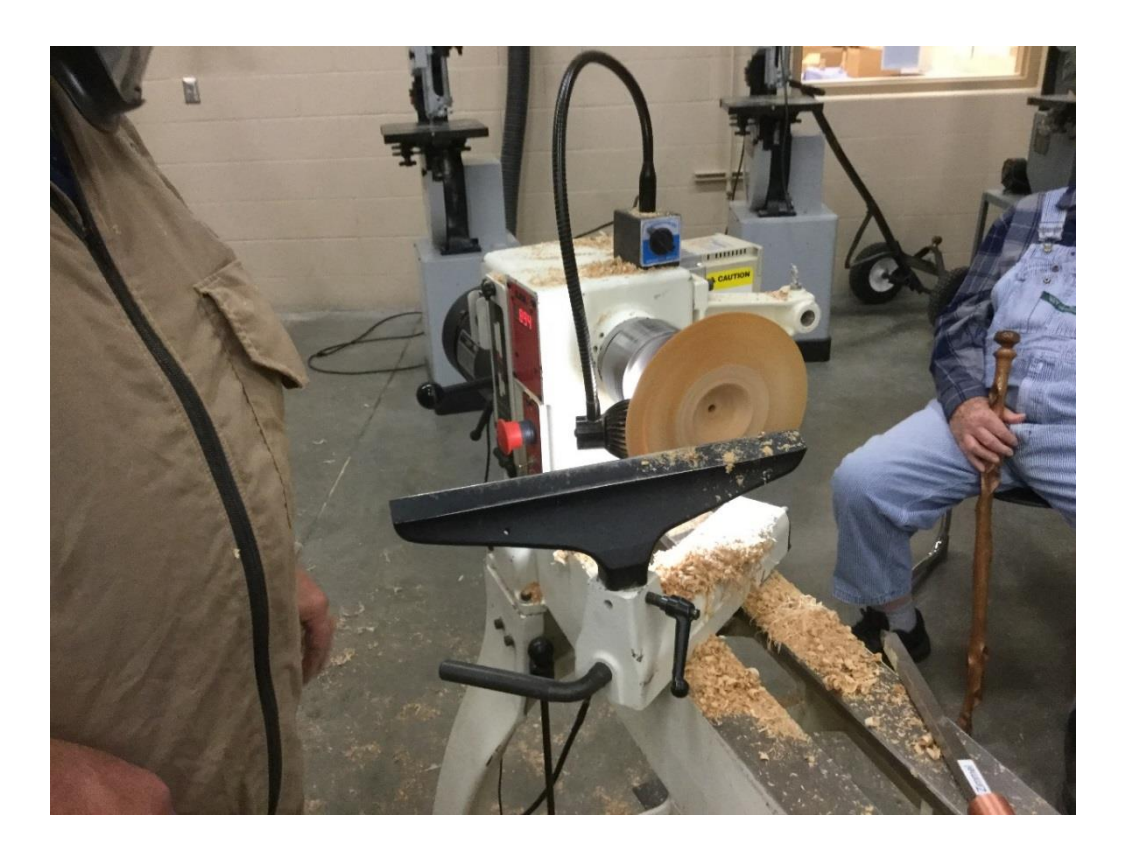
Light mounted to show the thickness of the crown and the brim as they completed