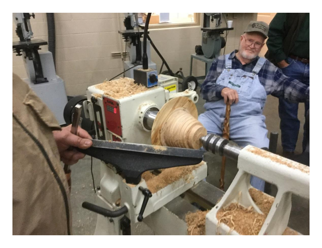
Roughout of the hat crown and brim completed