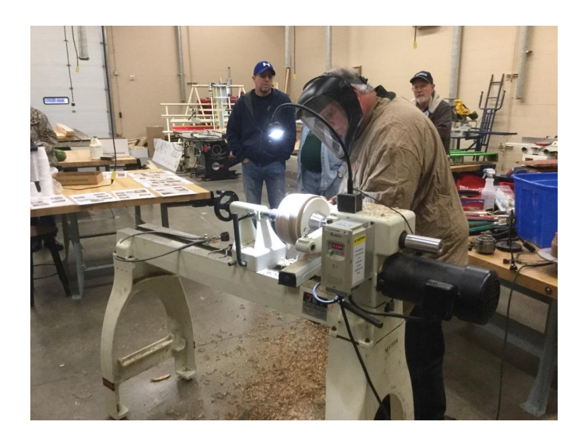
Starting the roughout from a wet blank