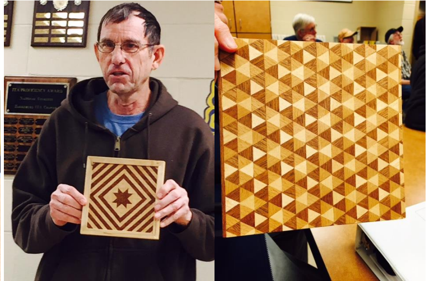
\frac{1}{2} " triangles into a wood quilt square.