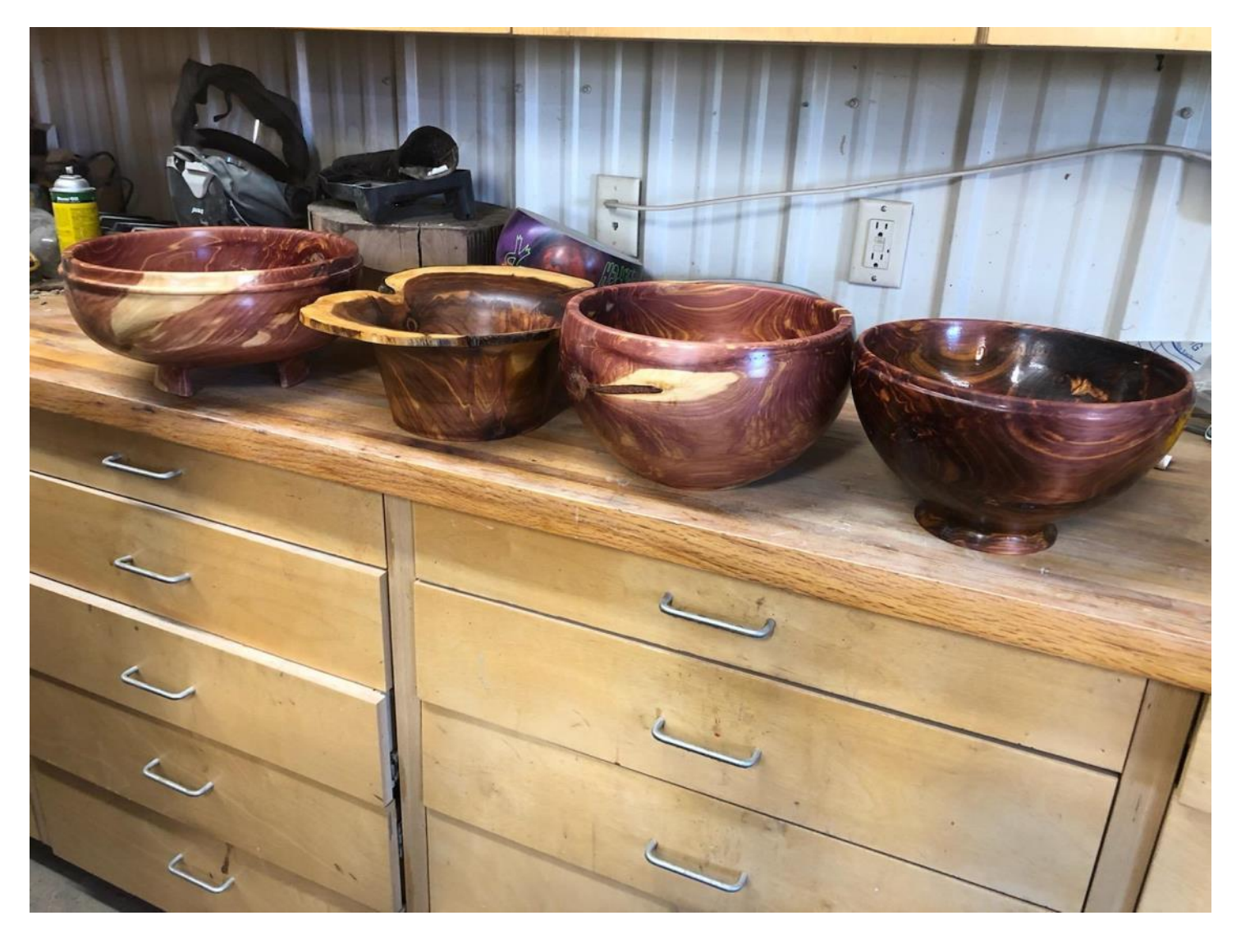
Doug again. "The last bowls of order for 4 cedar bowls this week. Next week should be great, plus Christmas."