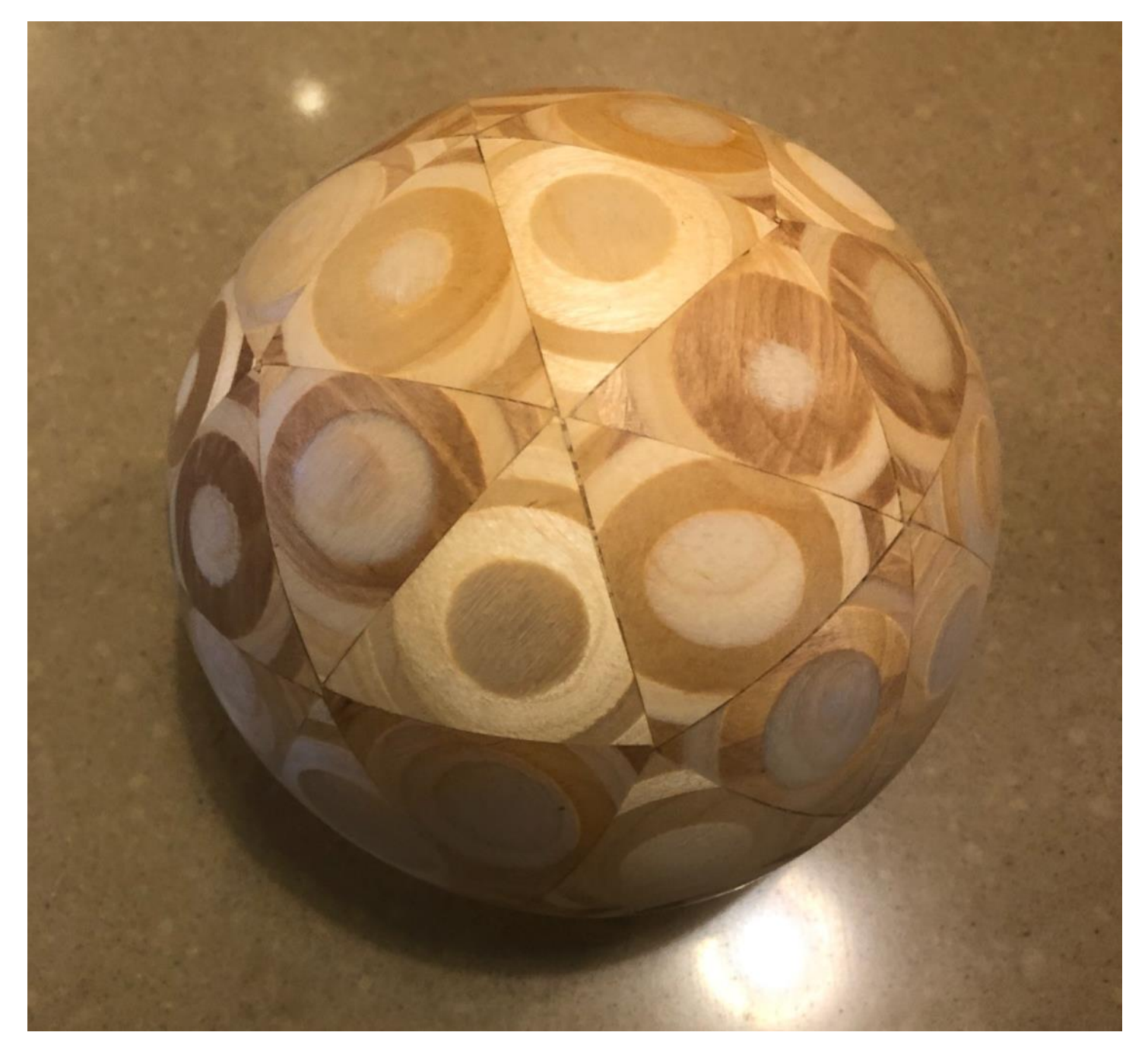
Also from Doug; "Finished up my first geodesic ball. 7" "B" at best. Next one 12-18". Really struggled with angles. Really should have studied harder in school."