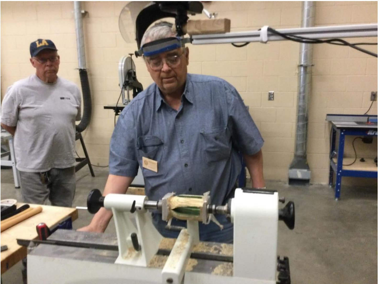
The blank mounted for finish turning