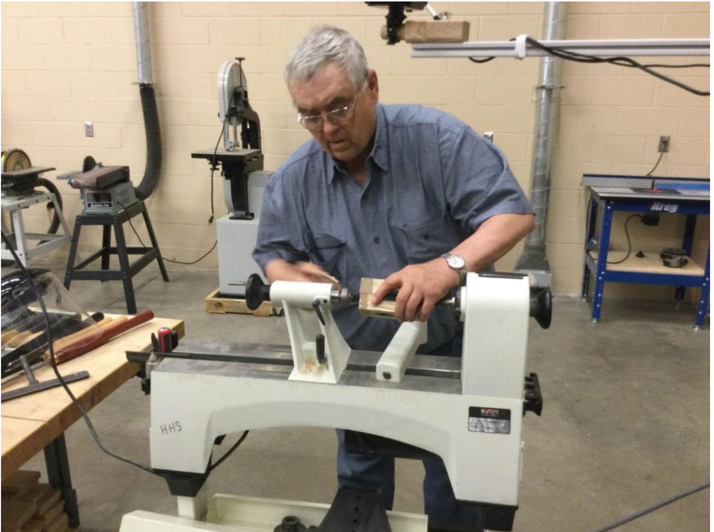
Mounting the blank for first turning