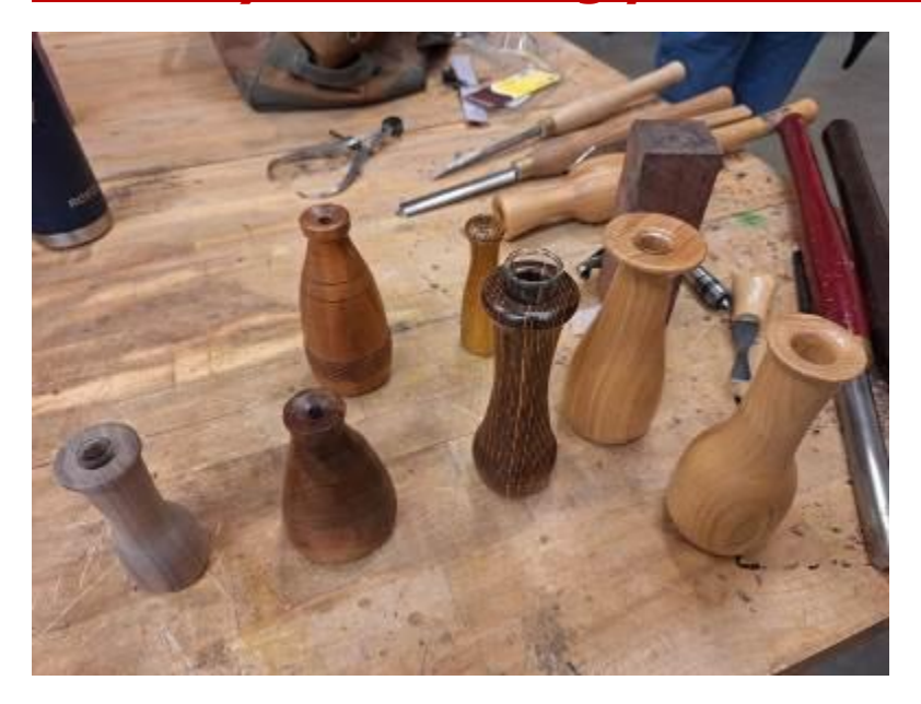
Sorry I didn't get any pics of the actual demo.