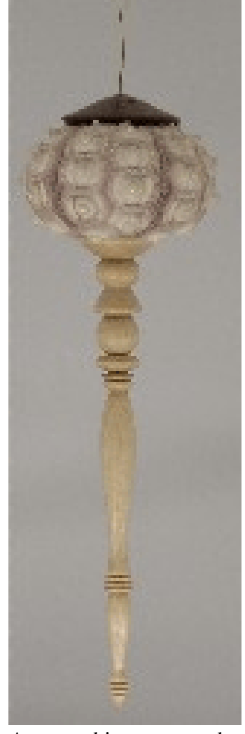
A sea urchin ornament by Frank. Fine detail in the finial.

Note that many of the images here were taken using the light booth that Royce brought. If you have pieces that you would like to have good images of this might be a way to develop good shots and lighting. More incentive to bring your work to a meeting.