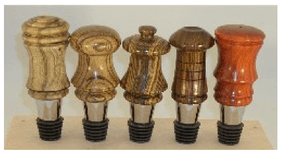
A nice series of bottle stoppers turned by Jim Canning. These are an excellent way to practice technique on small pieces of exotics.